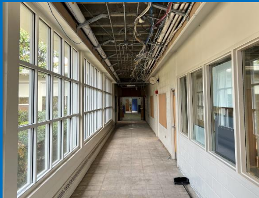
Ceilings & floors removed in the front hallway